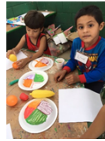
SFL Activities: garden beds; garden therapy for special needs youth; pollinator art class; MyPlate nutrition