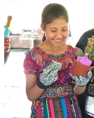
Mayan children received herb seed packets during a Gardening Fair