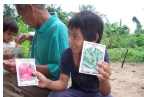
Early projects: Seeds for Life seeds packets donated to children in Peru and Afghanistan

This project was initiated in 2004 by the Houston Federation of Garden Clubs , and the A&M Garden Club in College Station. Seeds were distributed through the military in war zones. District IV also collected seeds locally at a garden center and donated them locally.