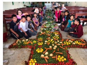
A&M Garden Club members promoting consumption of fruits & veggies